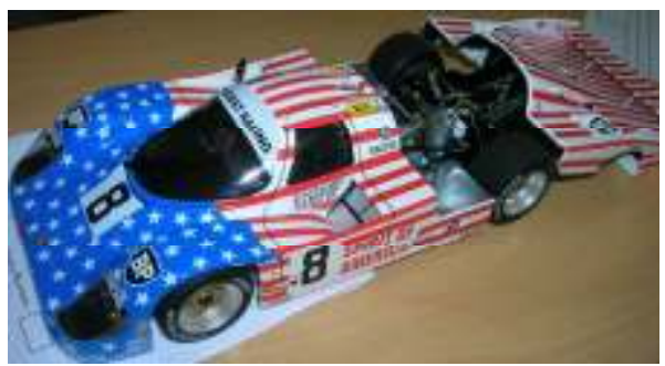
Best Theme (Crazy 8's) Winner