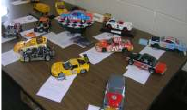
There was a good turnout on the contest tables. The Racing class table is pictured above.