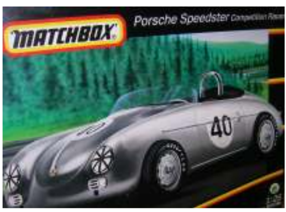
See www.jimmyflintstonestudios.com to order.