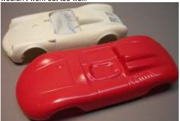
So I grabbed one of these transkits. As you can see it is better than the old slot car. It consists of three pieces, the body with molded in dash, a chassis plate

At the recent Rockford event, Jimmy Flintstone Studios had several tables of resin bodies, figures and assorted pieces of his usual hot rod theme products. The resin bodies are nicely done, but not my usual subject. But as I was walking off something at the corner of his table caught my eye, this Porsche 550 Spyder transkit. This has been something I was on the lookout for, there have been some slot car bodies and I believe there was a resin kit some time ago but nothing at a reasonable price. I was even going to try to do a curbside display piece from an old Russkit slot car body, but that would have been a project that probably wouldn't work out too well.