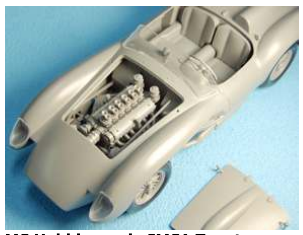
MS Hobbies resin IMSA Toyota