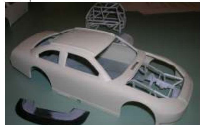
Also two resin 1/24 Dodge Charger bodies, by Time Machine Resins, a coupe and a convertible, to use along with the new Testors Charger kit