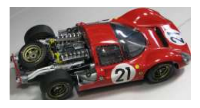
Hasegawa Ferrari 1958-59 in 1/24!