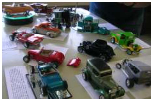
Commercial Vehicle Class winner below.