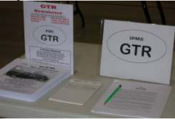
GTR had some tables in the vendor room.

The 9<sup>th</sup> Rockford Wheels in Scale Classic Plastic Event was January 27 at the Ken-Rock Community Center in Rockford. The attendance was good, most of the vendor tables were full.