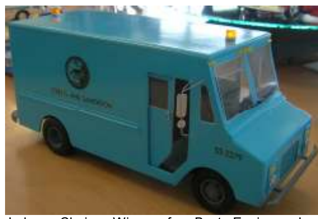
Judges Choice Winner for Best Engineered model