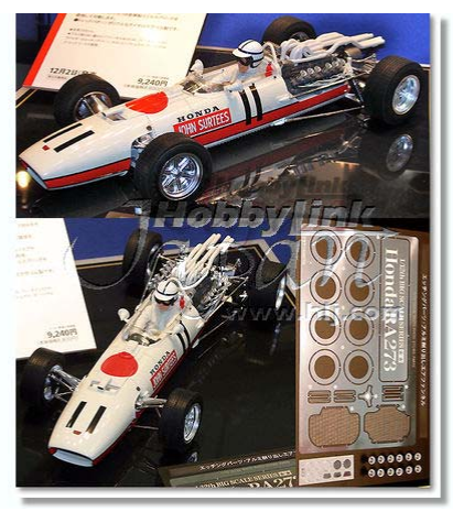
The Toyko Hobby Show is October 11-14, we await new product announcements.

The engine is very detailed and includes wire for the plugs. The suspension works (rubber tires, of course, and matte silver-plated wheels), with metal springs for the shocks. Wire mesh is included for the main grille, too. The new metal and photo-etch parts include the air funnel, radiator, steering spoke, oil cooler and brake disc. Markings are included for a number of cars from the 1966 and '67 seasons and you even get a well-molded driver figure. A fine kit, with a lot of history riding on it!