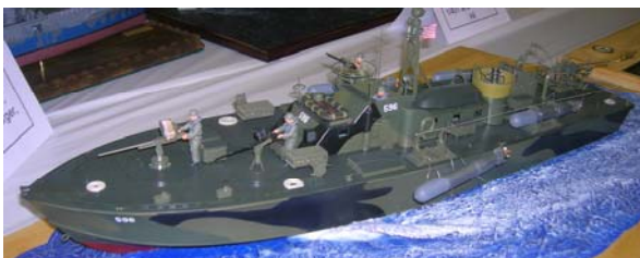
Best Ship winner, PT Boat.