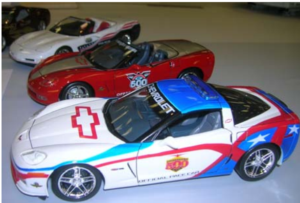
Corvette pace car collection.