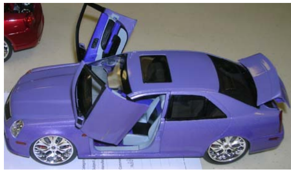
The Theme was Famous Cars (Movie/TV), this was the Theme winner.