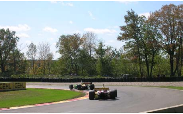
Going into Turn Six

The race saw a lot of yellow flags, making for quite a bit of action. The last accident caused a red flag after Katherine Legge had a violent high speed wreck on the back straight. After an eerily quiet 45 minutes, she was alright, the race resumed and AJ Almendinger went on to win a two lap shoot out at the restart.