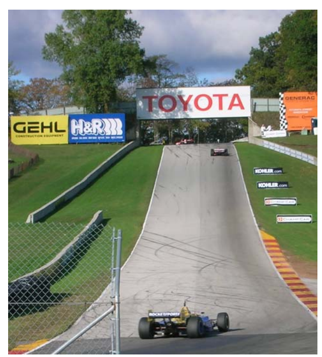
Action at the Road America Champ Car Grand Prix, Sept 24 in Elkhart Lake, WI. Going up the hill toward Turn 6 in the pre-race warmup.