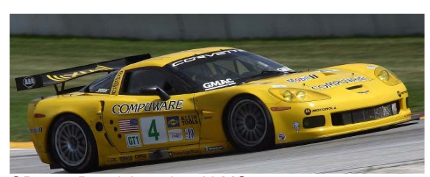
CR-6 at Road America ALMS 2005

The suspension detail is minimal, with metal axles. But there is brake detail. The tires are rubber, no sidewall detail but there are decals for two versions of Michelin lettering. The wheels are the correct style, but they are chrome. Since the real car features aluminum wheels, these need to be stripped and painted.