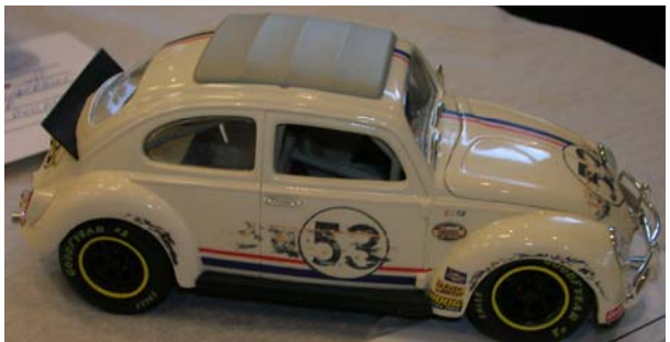
Polar Lights Love Bug updated to the latest movie specs.