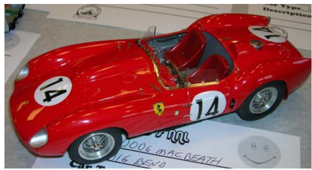
A great resin Ferrari 250