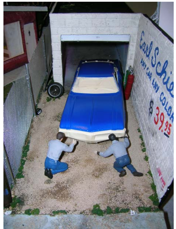
CARS in Miniature's 70's diorama