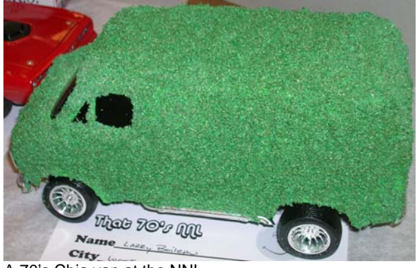
A 70's Chia van at the NNL

? = event or date not yet confirmed as of this printing