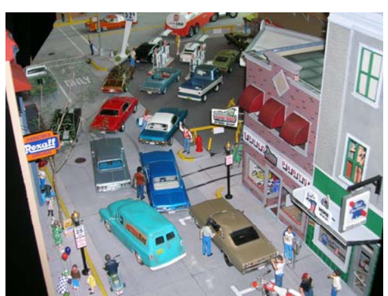
Winnebago Auto Modelers 70's diorama