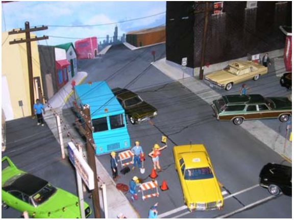
CARS in Miniature's 70's diorama