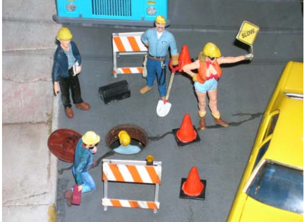
CARS in Miniature's 70's diorama