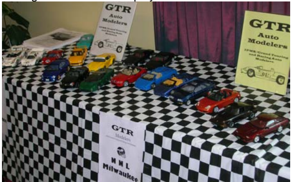
The GTR club display

The 14<sup>th</sup> Annual Milwaukee NNL, hosted by AMG (Automotive Modelers Group) was held April 22. There was a new location this year, at the Excellence Center, in Waukesha just a few blocks from the old location at the now closeed Holiday Inn. The new room was nice, lots of space and with windows. Attendence seemed a bit down from previous years, but it was hard to tell with a bigger room. The quality was high, as always there were a lot of great models on display.