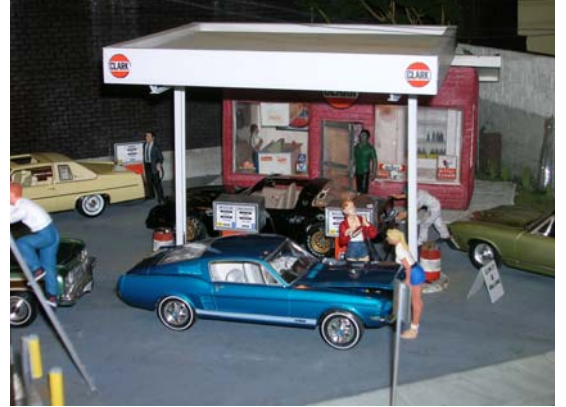
CARS in Miniature's 70's diorama