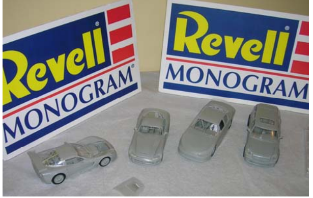
Revell Monogram's upcoming new releases on display