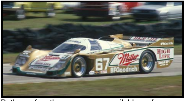
Both of these are available from: <u>www.mshobbies.com</u>

Also, a transkit to model the 1989 Daytona 24 Hour winning Porsche 962 (based on the Tamiya 962 kits) is now available from mshobbies