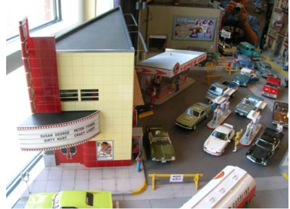
Winnebago Auto Modelers 70's diorama