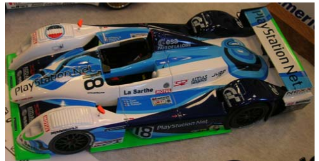
Profil 24 resin Pescarlo-Judd