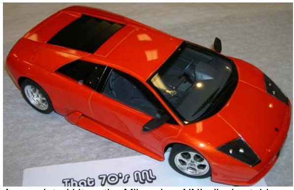
A completed kit on the Milwaukee NNL display table.

All in all it's a nice kit and is a welcome addition to my collection.