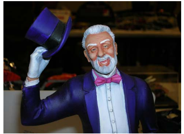
A nicely done Ed Roth figure