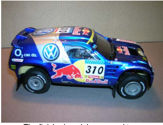
The finished model compared to...