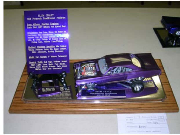
People's Choice Award Winner