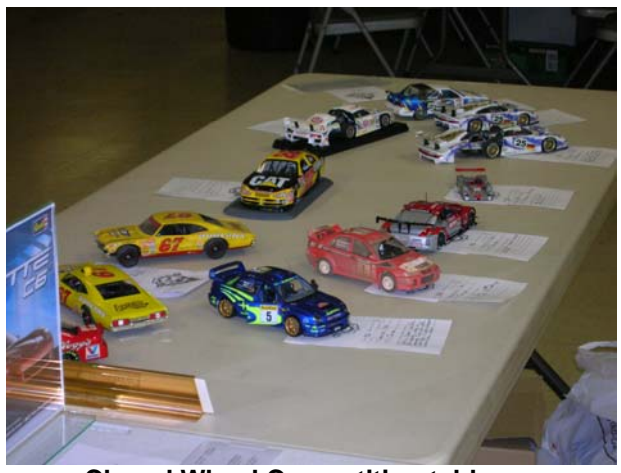
Closed Wheel Competition table