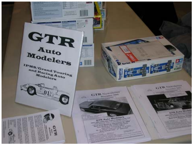
GTR had our usual table in the vendor room, and several members used it to sell off some surplus kits.