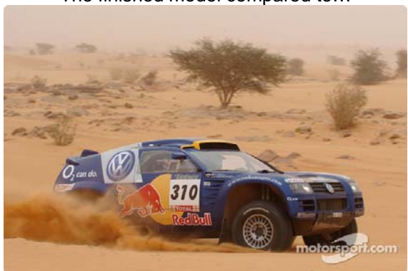
....the real car in action.