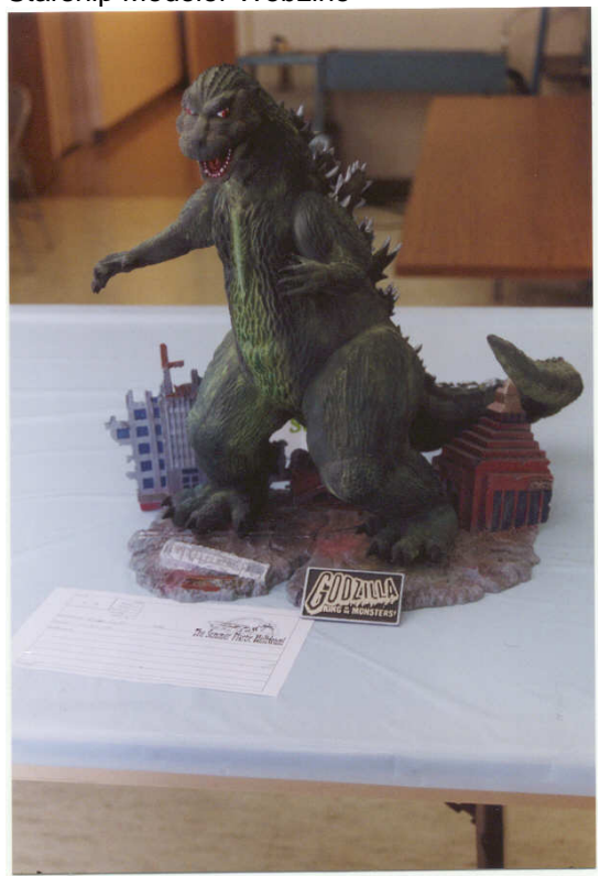
Godzilla: Best Sci Fi Subject

Award Sponsors: IPMS Lakes Region Scale Modelers, Lake Michigan Model Car Club, and Starship Modeler Webzine