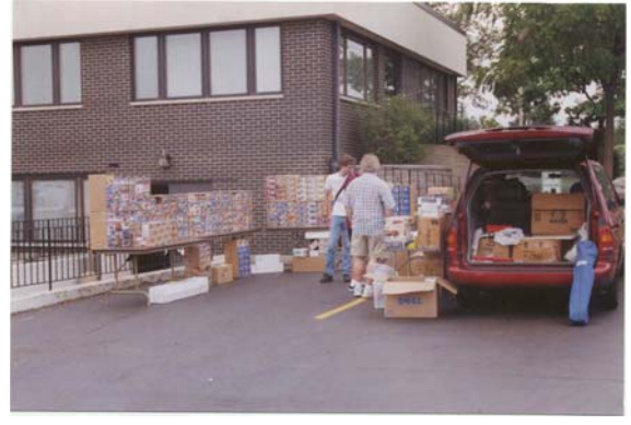
Vendors in the outdoor Trunk Sale