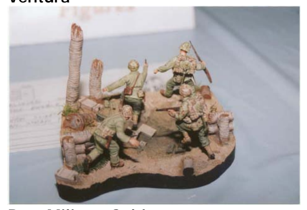
Best Military Subject

Here are a few statistics from the show. Models on the display tables: 101 Models on CARS club table: 150