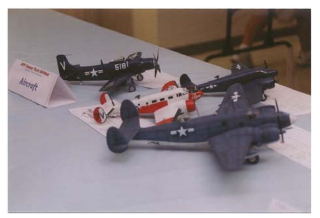
Best Aircraft: Lockheed PV-1 Ventura