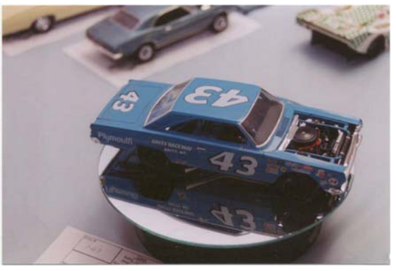
1967 Petty Plymouth NASCAR voted Best of Show Automotive