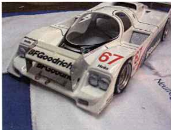
GTR Auto Modelers Newsletter

M & S Hobbies has announced a new transkit to model a late 80's version IMSA Porsche. See their website for details: www.mshobbies.com .