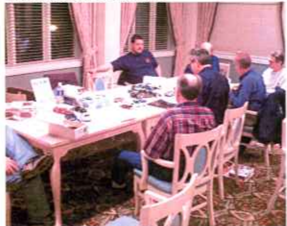
Then it was on to Show and Tell. Among the highlights were:

The February GTR meeting was held 2/19/05 at the Fountains of Crystal Lake. After the treasury report and mailbag, we discussed some future meetings. There will be no regular April meeting; instead we will have a club road trip to the Milwaukee NNL. June will be a meeting and barbeque at my house in Cary. We also discussed a possible road trip to the Redman Historic races at Road America instead of the July meeting. And we discussed this years NIMO event replacement, see the Events section of this issue.