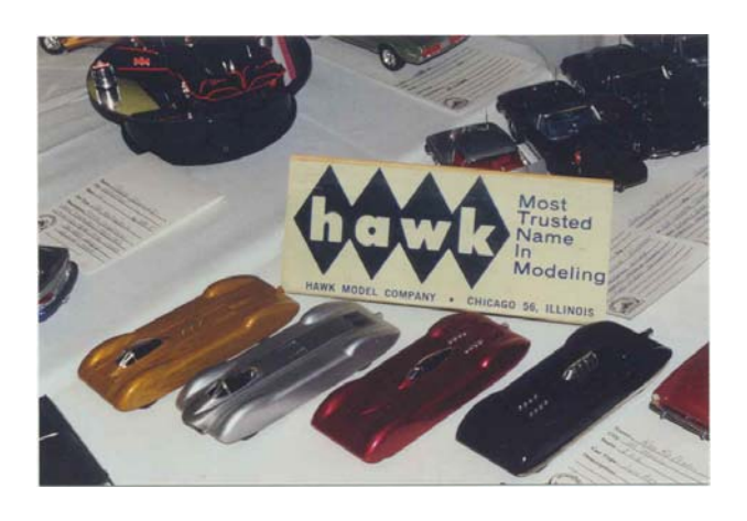
A collection of vintage 1/32 kits by the late model manufacturer Hawk.