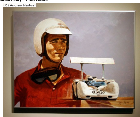
For details see: www.petroleummuseum.org

The seven original Chaparral racecars designed by the legendary Jim Hall have been put on permanent display in the Chaparral Gallery within the Petroleum Museum in Midland, Texas.