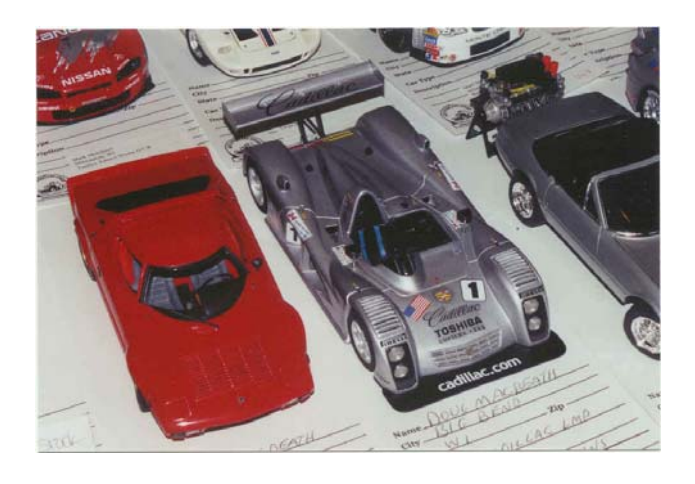
A resin Cadillac LeMans racer

Here's some pictures of models on display.