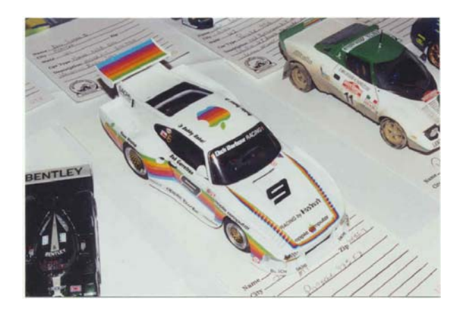
A resin Porsche 935 by Scale Coachworks.