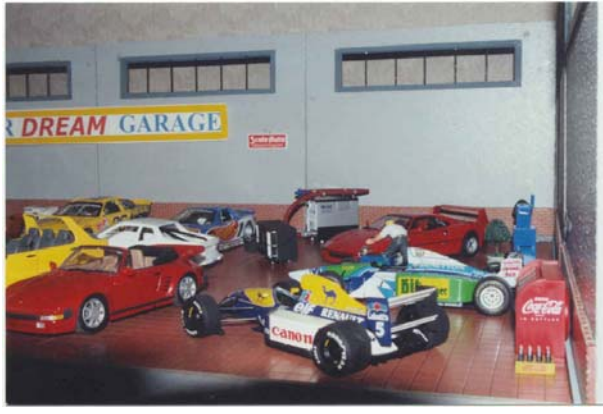
There was also a parking lot outside.