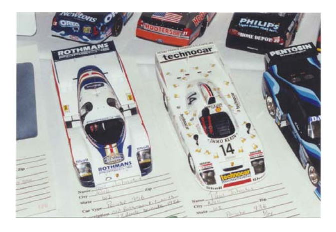
Porsche 956 and 936