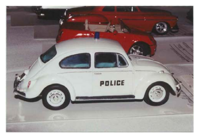
A VW Beetle police car.