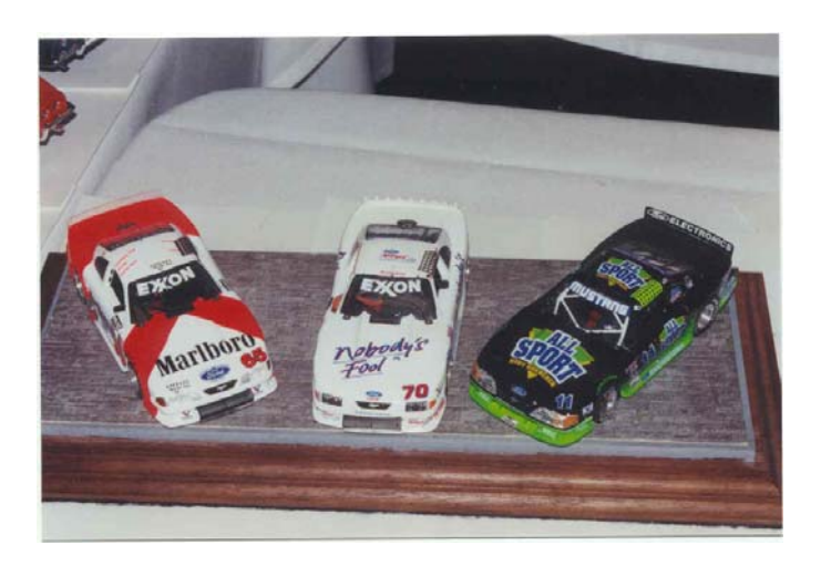
Three 1/43 Trans-AM and IMSA Mustangs