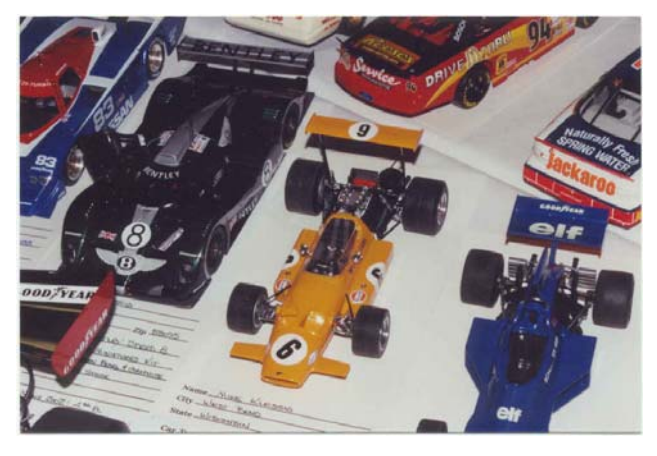
A resin Bentley LeMans racer, a Heller 1968 McLaren Grand Prix racer and a resin Tyrell F1 car.