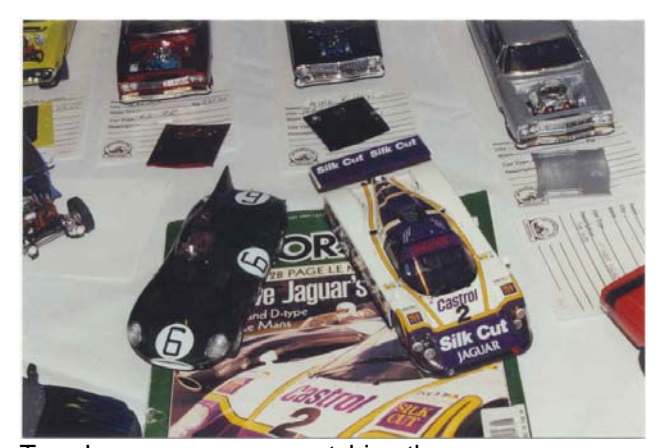
Two Jaguar race cars, matching the cover photo on the magazine.

So it was another great event, lots of nice models, a large raffle, and a great time hanging out with fellow modelers.